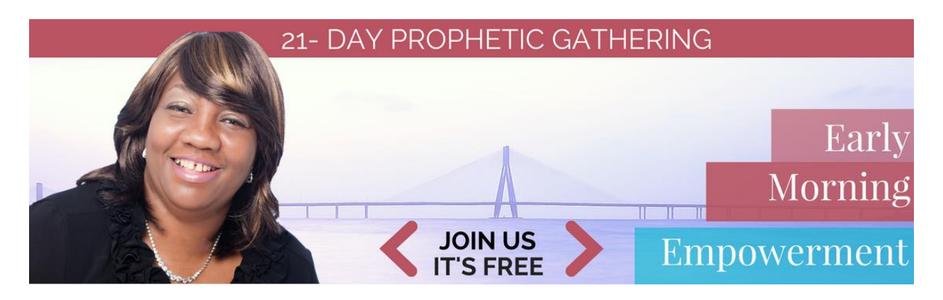
Early Morning Empowerment 21- Day Prophetic Gathering